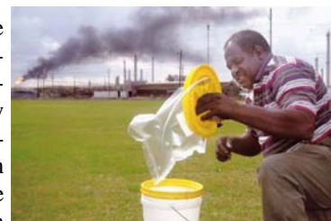
The Bucket in Action

REMINDER: Submit your articles & creative writing for the December Louisiana Environmental Justice Voices by Monday, Dec. 5th!